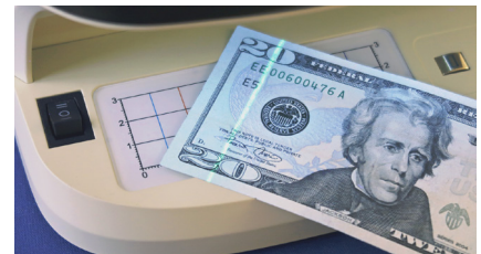
Use the UV light to verify hidden UV fluorescence security features of documents.