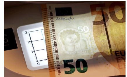
Verify watermarks by the white backlight.