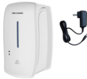
Optional AC / DC adaptor