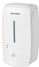
Hand sanitizer dispenser