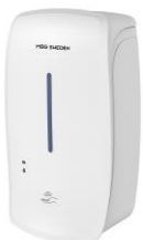
Hand sanitizer dispenser