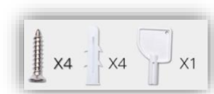
Mounting kits & key