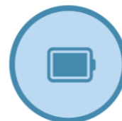
Low power light indicator