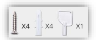
Mounting kits & key