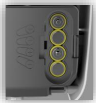
4 x AA batteries