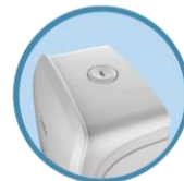
Lockable cover design