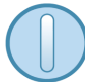
Visible window level