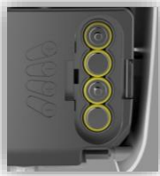
4 x AA batteries