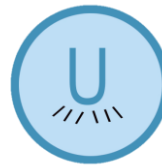
Improved infrared sensor technology