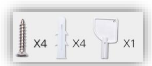
Mounting kits & key