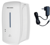
Optional AC / DC adaptor